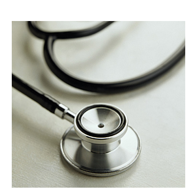
How are you doing?

As a result of managing Innovation effectively you will: